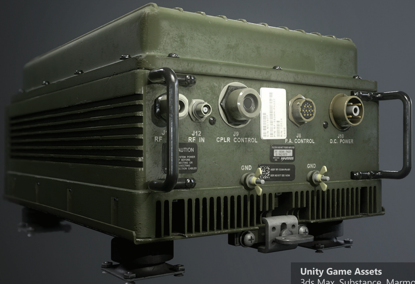
Unity Game Assets 3ds Max, Substance, Marmoset