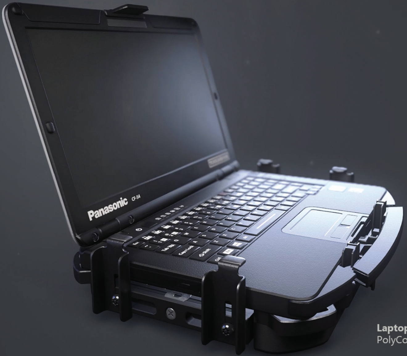
Laptop_Control PolyCount: 14,200