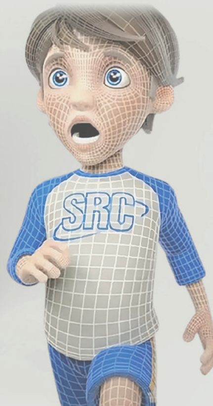
Meet Charlie - Rigged, Animated ZBrush, 3ds Max, Arnold, TopoGun