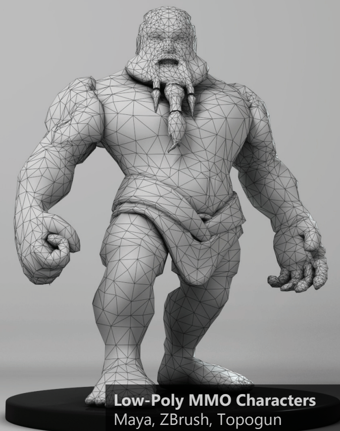
Low-Poly MMO Characters Maya, ZBrush, Topogun