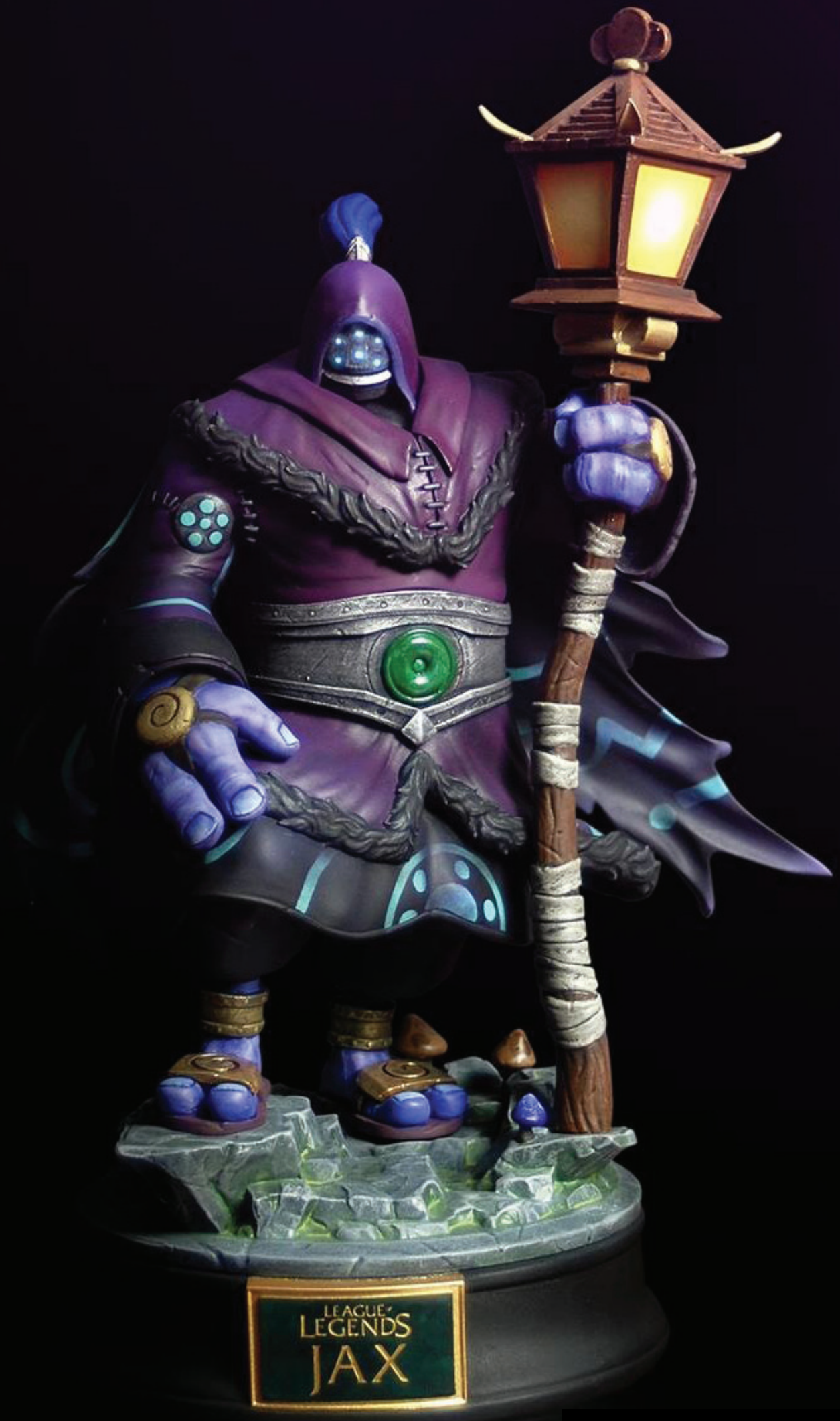
JAX - Painted 3D Print ZBrush