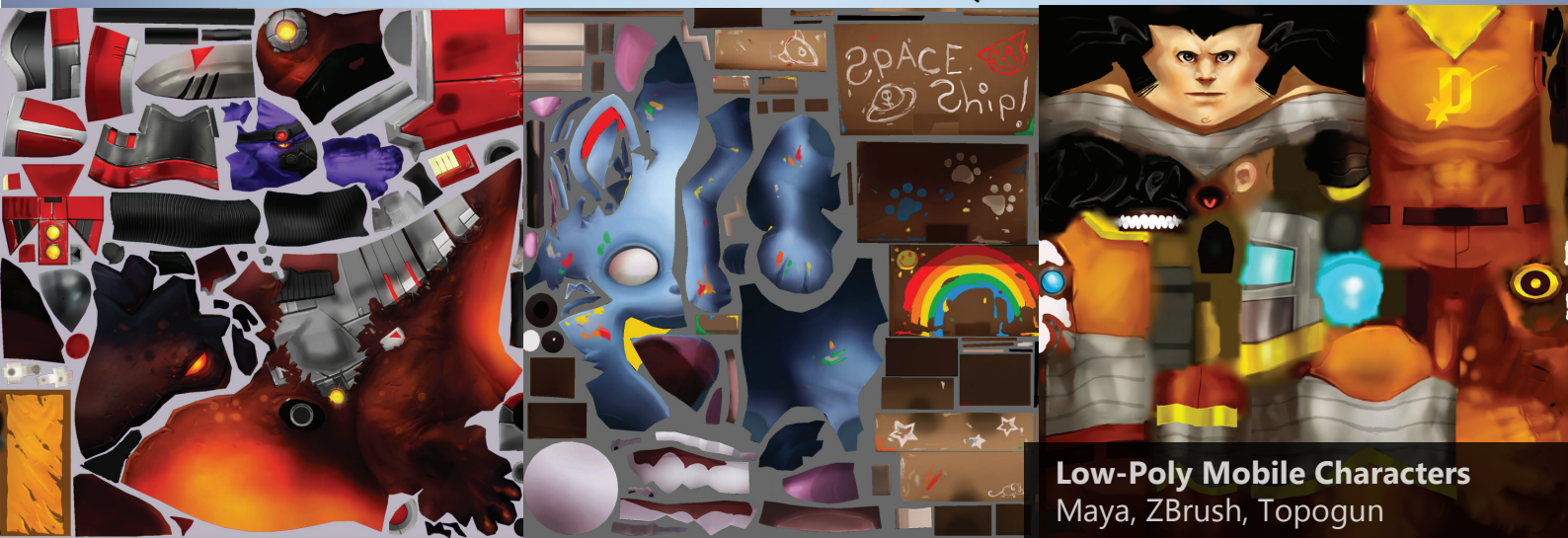
Low-Poly Mobile Characters Maya, ZBrush, Topogun