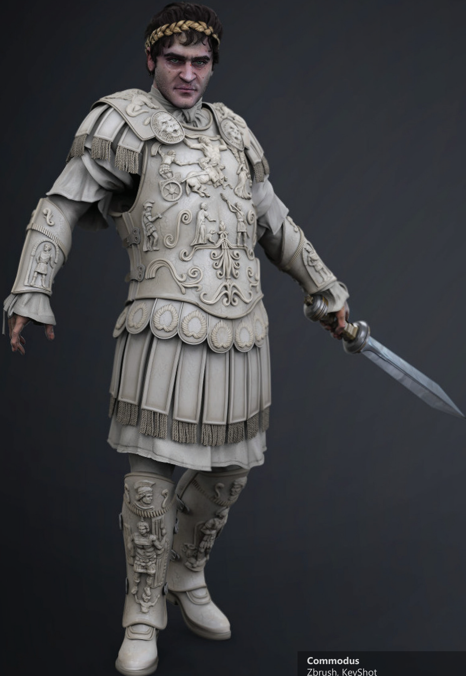
Commodus Zbrush, KeyShot