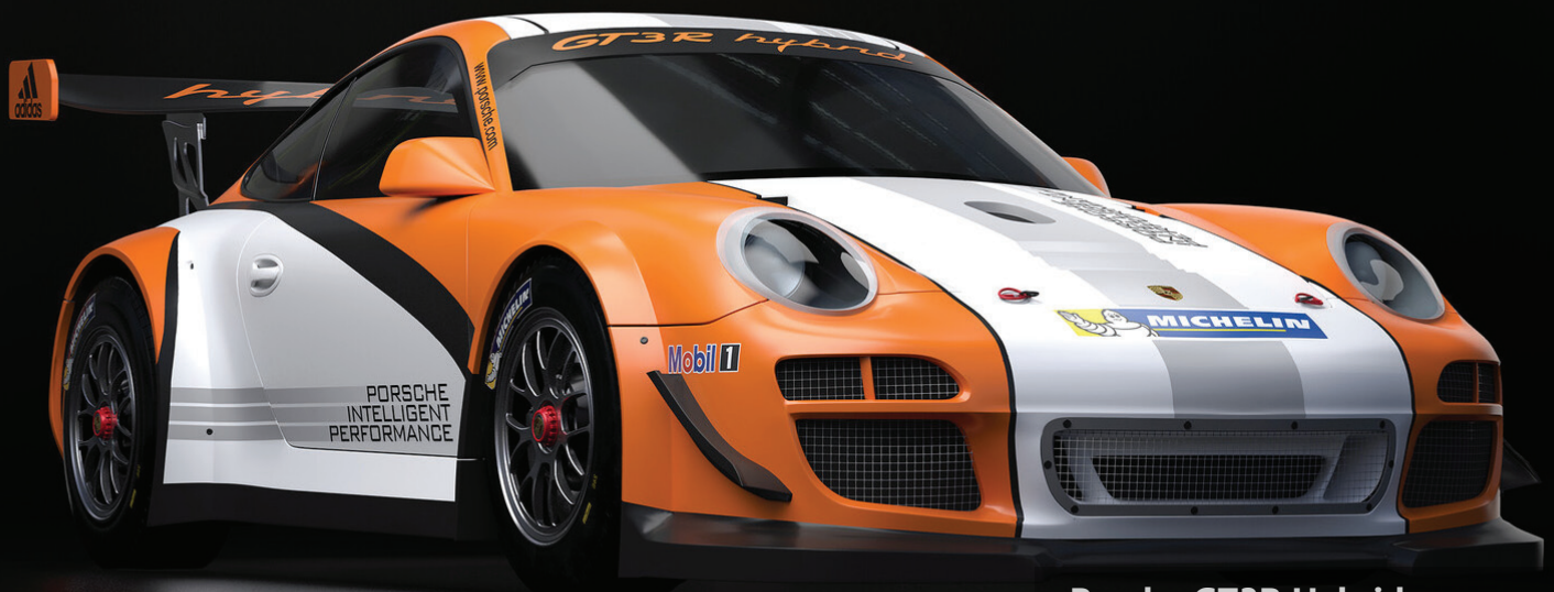
Porsche GT3R Hybrid 3ds Max, Arnold