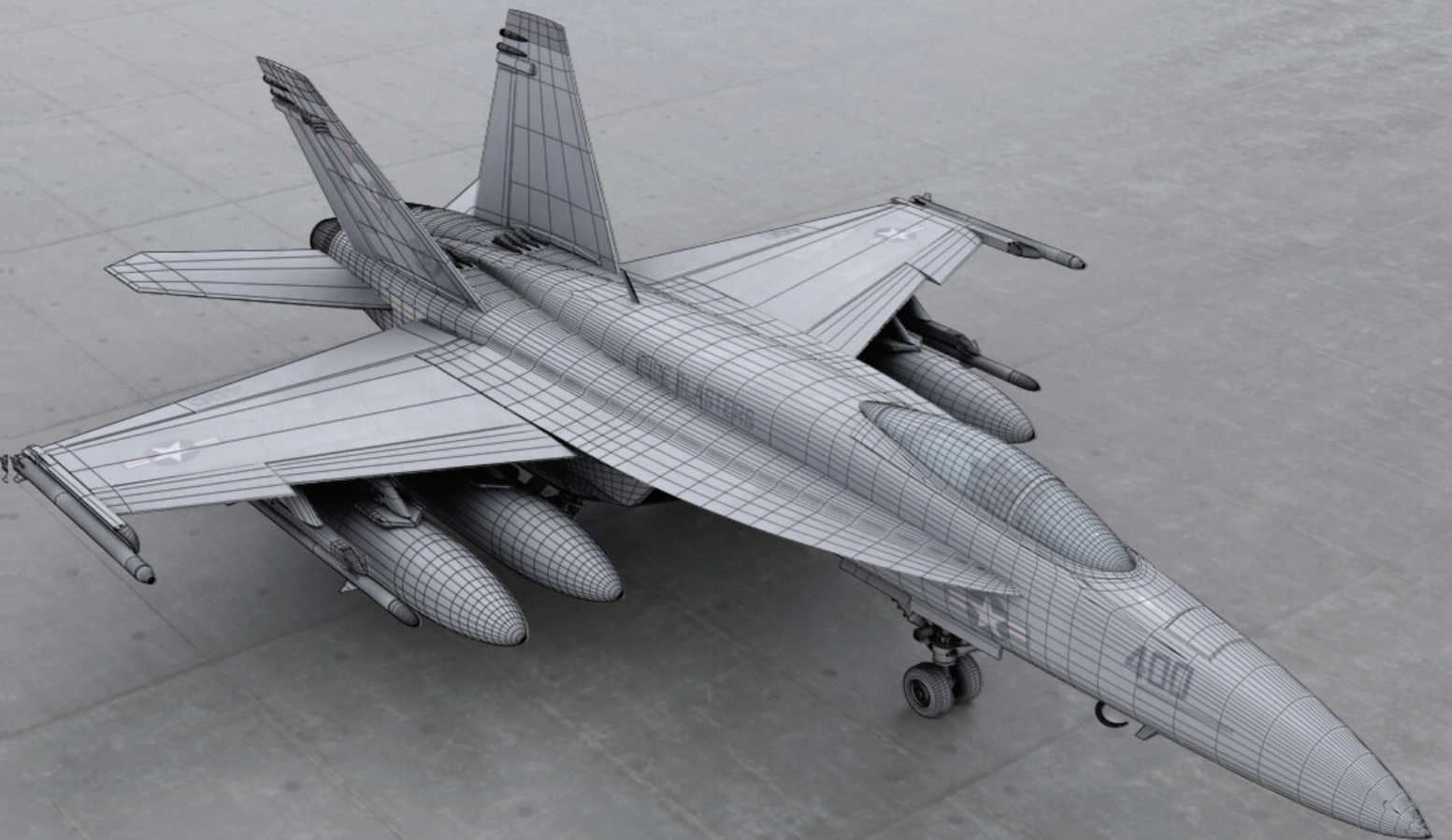
F/A-18F Super Hornet 3ds Max, V-Ray