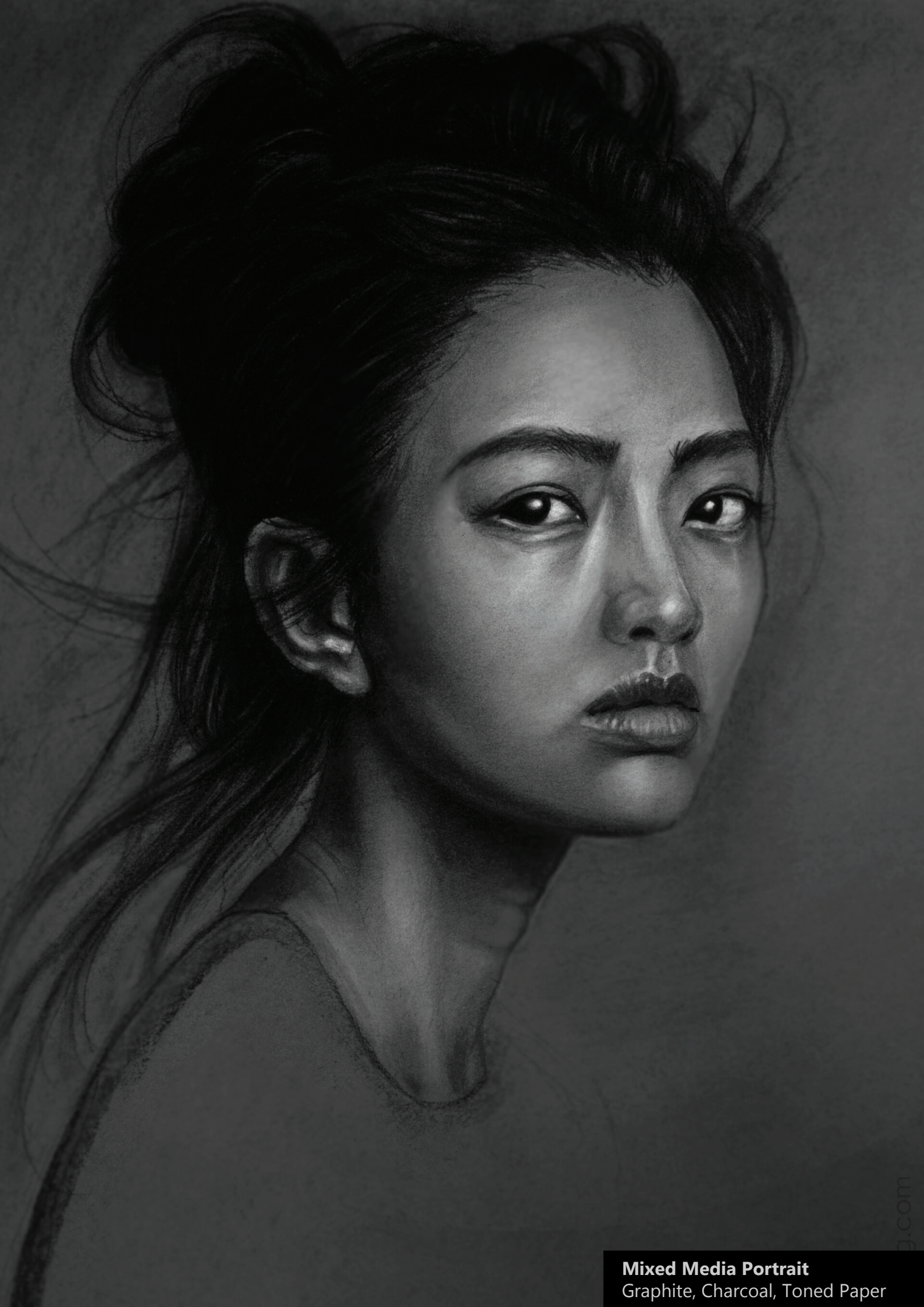
Mixed Media Portrait Graphite, Charcoal, Toned Paper